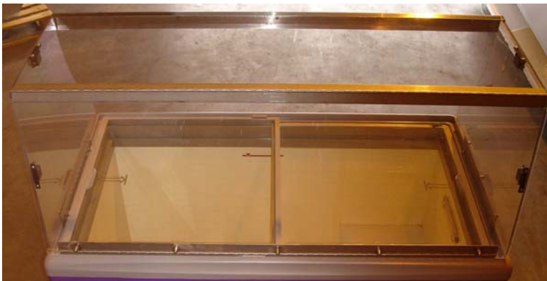
Above: Sneezeguard Assembled

Step 5: Make sure glass sliding lids are locked into place before folding down sneezeguard. When folding back down, fold down side pieces first. Then front and top piece lays down on top of side pieces.